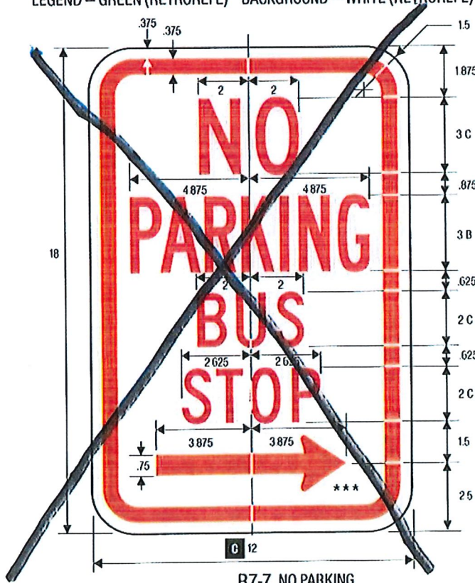
R7-7 NO PARKING

LEGEND – RED (RETROREFL) BACKGROUND – WHITE (RETROREFL)