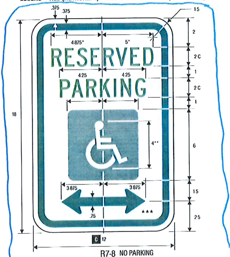
R7-8 NO PARKING

LEGEND – RED (RETROREFL) BACKGROUND – WHITE (RETROREFL)