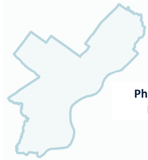
Philadelphia County ELRC Region 18