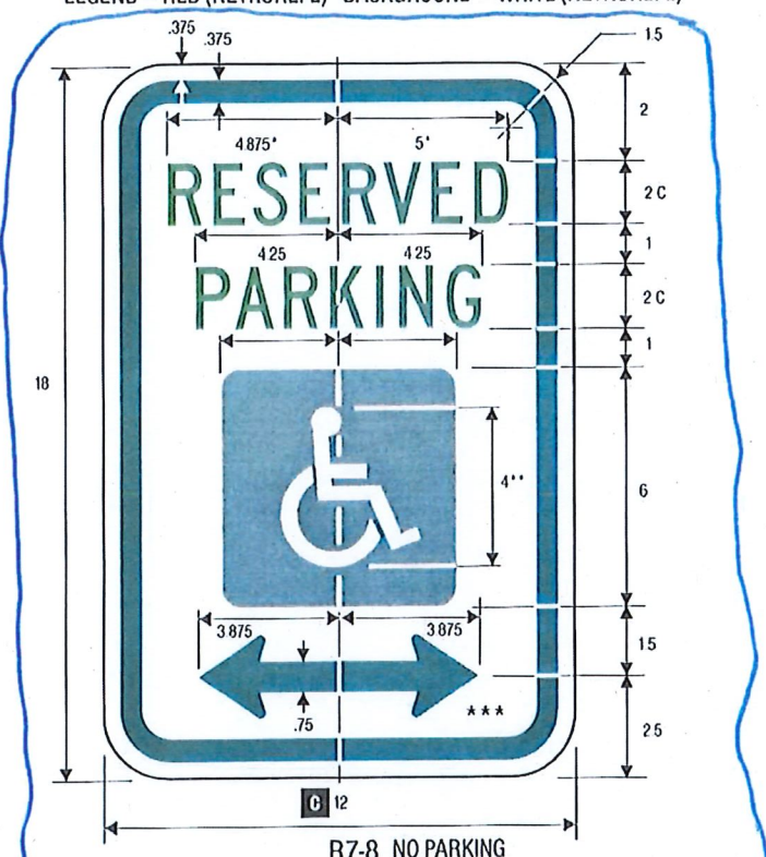
R7-8 NO PARKING

LEGEND - RED (RETROREFL) BACKGROUND - WHITE (RETROREFL)