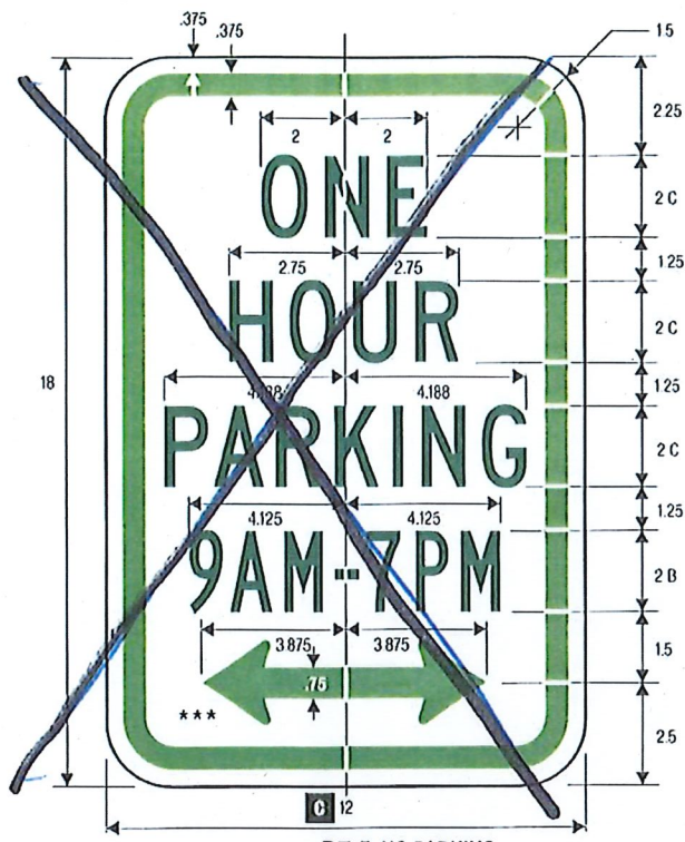
R7-5 NO PARKING

LEGEND - GREEN (RETROREFL) BACKGROUND - WHITE (RETROREFL)