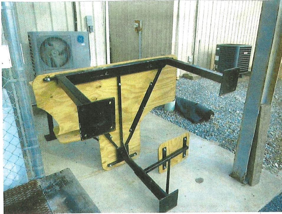
PHOTO – SHOOTING TABLE

Note: The PGC will supply the shooting tables (5). The Contractor will install the shooting tables on the new concrete floor slabs at the archery range.