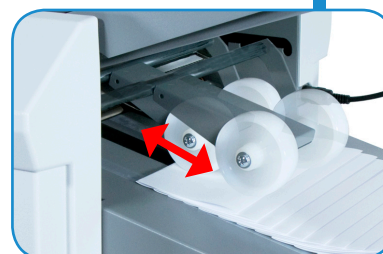
AutoStack™ Stacker Wheels