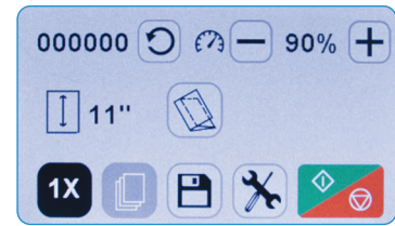
Large color touchscreen control panel