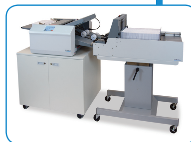
FD 2056 in-line with optional V-Stack36i Vertical Stacker, stand and cabinet

Formax - New Hampshire, USA www.formax.com